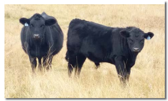
Look at this growthy halfblood Buster son, 105B, an April calf in October – efficient beef production!