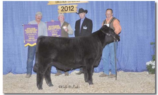
Gunslinger, 2012 Louisville Supreme Champion, sire of Lots 47 - 51.

Doll House Gunslinger 223Z, sire of Lots 47, 48, 49 and 50