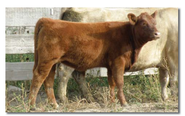
EZ Winnie the Red 127A, maternal sister to Lot 30