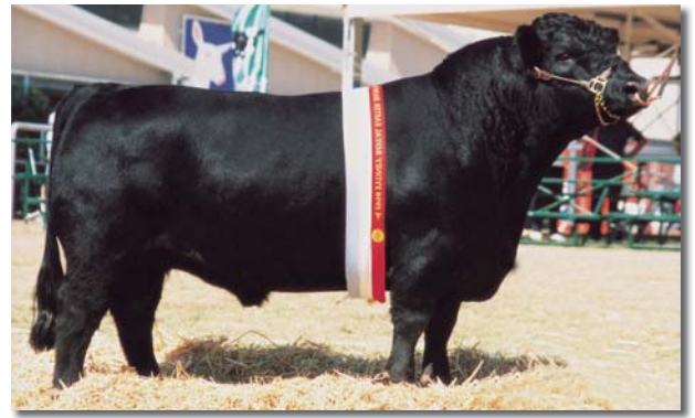
Quartermaster Q117, sire of Lot 35

Look at the deep-sided, easy-fleshing Spark Plug daughter that's due for a heifer calf by Boxcar right about sale time - should be a dandy