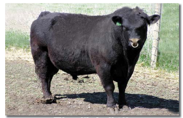
EZ Lexus 18L, sire of Lot 32