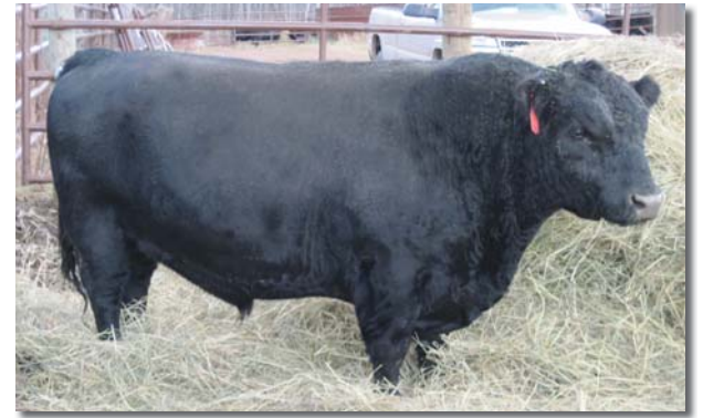
GTL Unique, sire of Lots 14, 16 and 17

EZ Perfection B10B is a great-made, clean-fronted, fullblood outcross Wurrung daughter out of the great Brambletye Perfection H002 daughter. She's stout made yet very feminine! She has a full sister in blood in the Pug Perkins herd in Hines, Oregon.