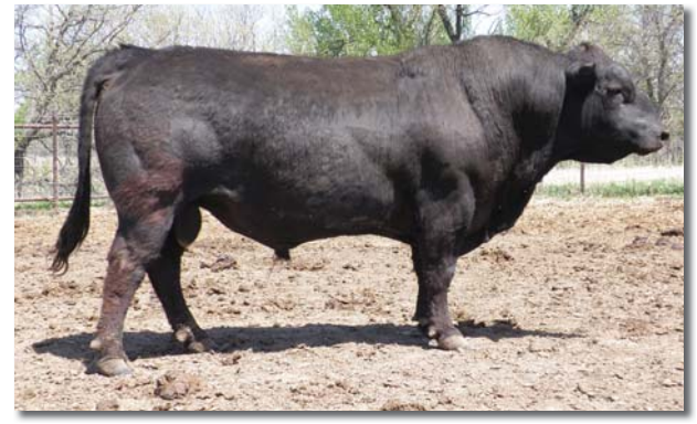
EZ Buster 303U, sire of Lot 33