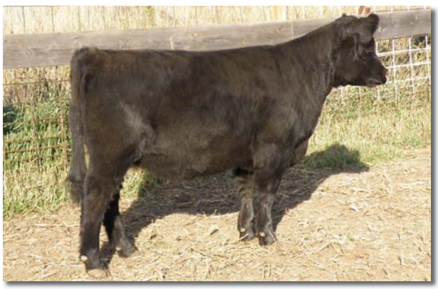
EZ Sunshine 46X, dam of Lot 21 as a calf