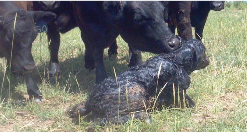
A beautiful picture...alive, unassisted, vigorous, 66# birthweight out of a fullblood Lowline bull.