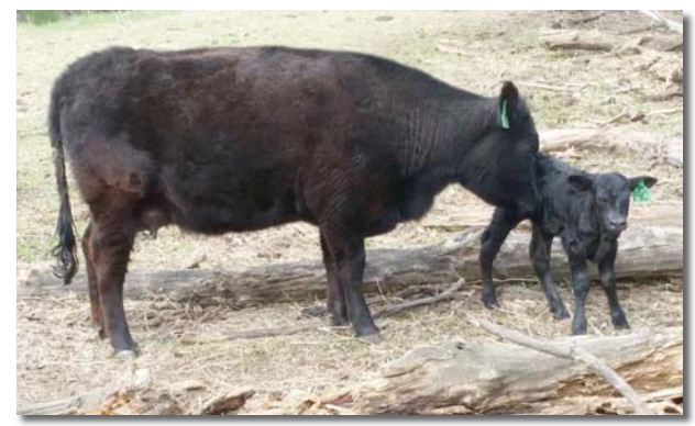
Lot 11 and her minutes-old heifer calf