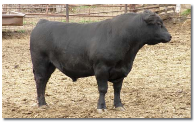
EZ Commando 51X