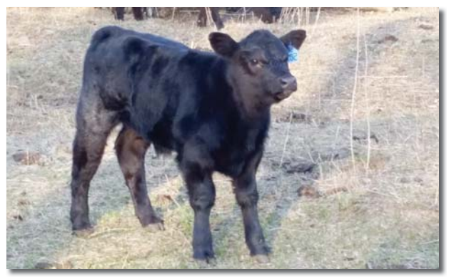
We sure do like the Sundance calves!