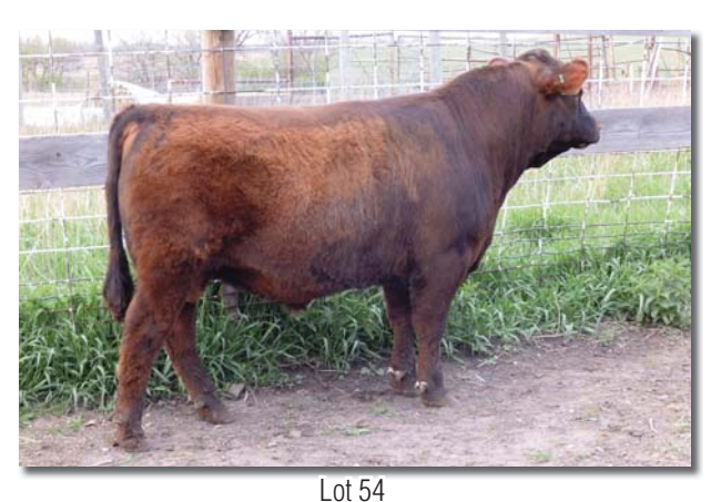
Discover Lowlines | Page 15