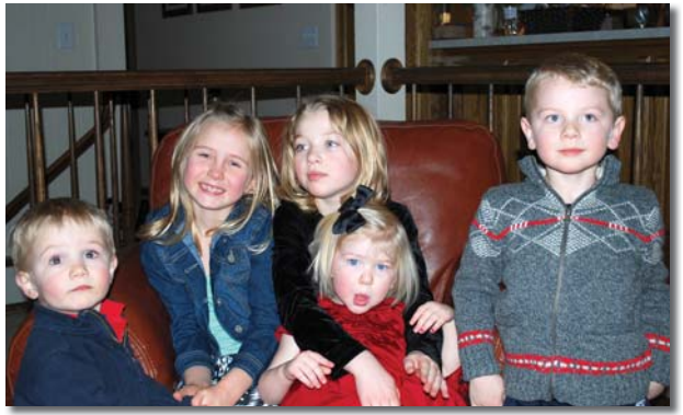
Grandpa and Grandma's pride and joy!!

Lot 34A: Halfblood heifer calf #108C sired by Sundance born 4/7/15, BW: 72#. These Lisbon daughters just don't miss! Check out her sweetheart of a halfblood heifer calf by Sundance. She already looks like a great brood cow prospect and she's only a few weeks old. She'll be bigger than most halfbloods.