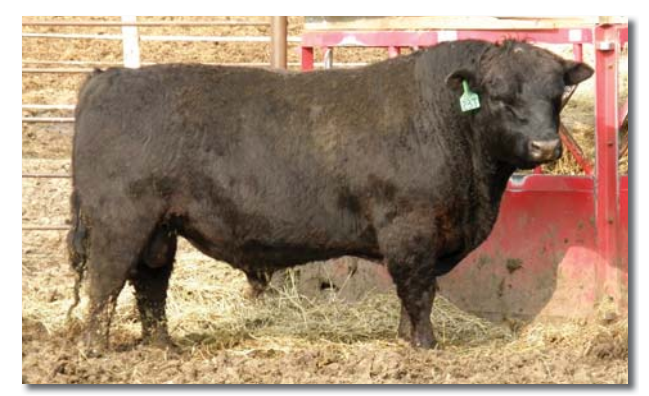
EZ Torch 23T, sire of Lot 15